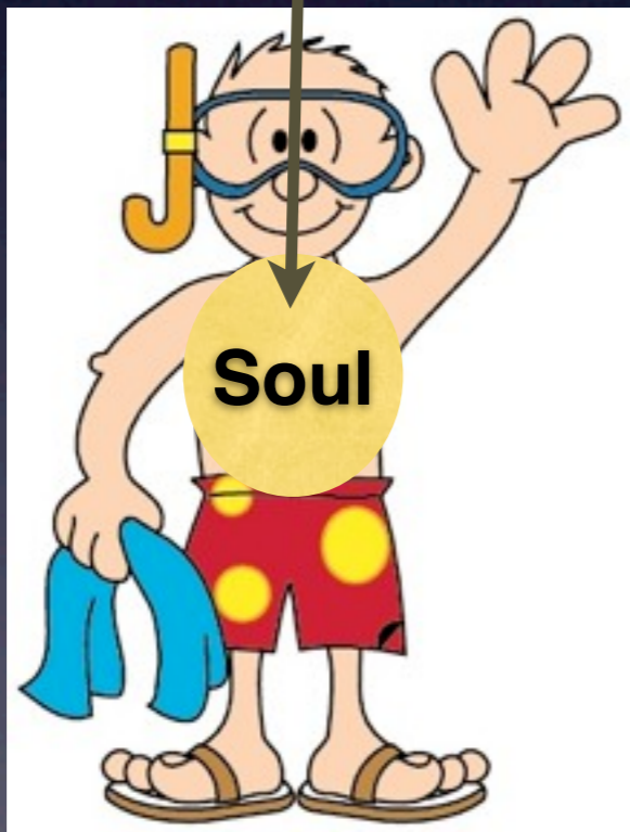
Our Present Condition