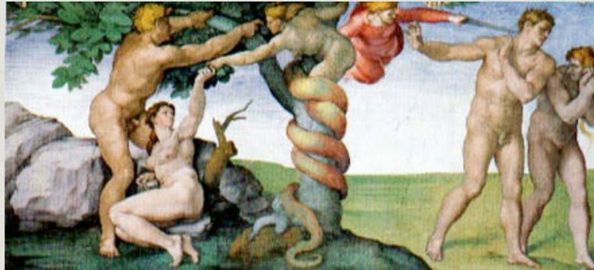
Michelangelo's Temptation and Fall from the Sistine Chapel Ceiling.

Now the serpent... said to the woman, “Has God indeed said, ‘You shall not eat from every tree of the garden?’ ”